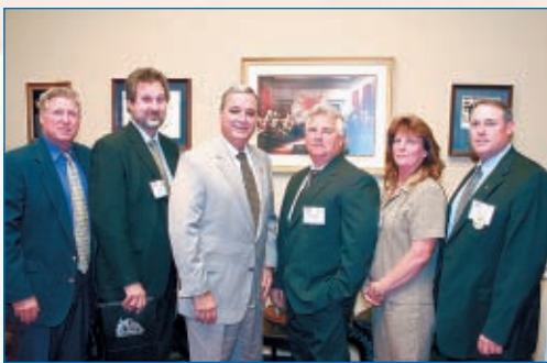
Rep. Jeff Miller meets with Farm Bureau members during "Field to the Hill."

This is a WORKING trip – wear your walking shoes!